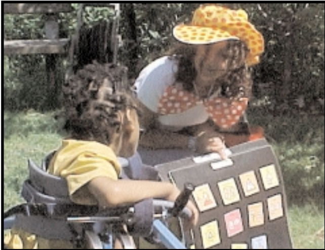
PS 4K teacher with student

What was your last visit to the garden like?