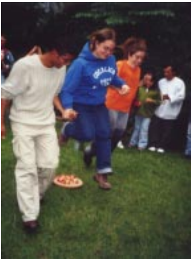
The trio defies cultural, religious and political differences to join hands and work together at community gardens in the South Bronx.

On a personal level, it provided me with the opportunity to explore community gardening, which is something I have been interested in pursuing since graduating college. It was astounding to me to witness a governmental office empowering the community in such a sincere and personal way. All the field coordinators were truly concerned with the gardeners' needs and in tune with the unique situation of each garden. Visiting gardens and speaking to community members and Green Thumb employees really helped to broaden my ideas of the successes and obstacles inherent in community gardens. When I arrived, I wanted to believe that the gardens were peaceful oases in the city. Seeing some of the conflicts, power struggles, and development threats shattered this idealistic image, but convinced me more entirely of the value of the gardens. There is so much life in these spaces and the moments of conflict only make the moments of cooperation and community more valuable.