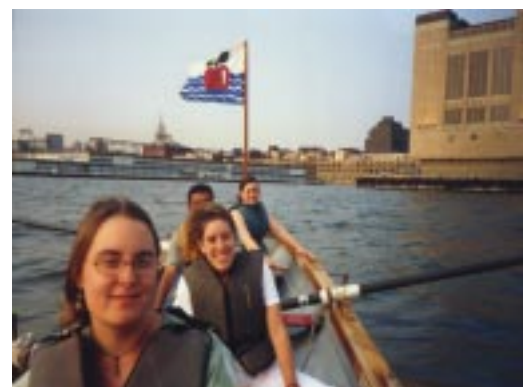
The interns take a break from collecting water to playing in the water. Canoeing together on the Hudson with Floating the Apple. Row! Row! Row!