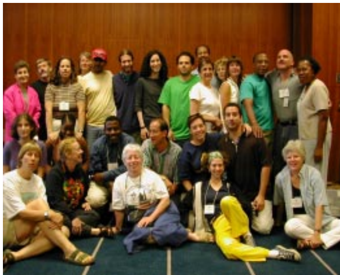
ACGA board members and local host committee pause for a pose at the 23rd Annual ACGA Conference in NYC.

On the weekend of July 26, over 400 gardeners from around the world convened at Columbia University for the 20th Annual ACGA Conference. The conference was deemed the best so far by the international attendees. Much of this praise was due largely in part to the many generous gardeners who donated their time to help ACGA prepare and host the tours of NYC's community gardens. Over 10 different tours were conducted throughout the five boroughs visiting over 100 gardens in one day! The tours allowed international gardeners to see the gardens' diversity and the integral role they play in their community. The tours revealed how vegetable gardens from East NY in Brooklyn to Harlem in Manhattan grow food to feed hungry people in their community; composting projects in community gardens help to reduce solid waste while producing nutrient rich compost for garden beds; and gardens as centers of art, music, culture and free outdoor programming to the public. Each garden is different, reflecting the flavor of the neighborhoods they are a part of, yet similar in how they serve the community. The international tourists were truly amazed with the incredible spirit and dedication of NYC's community gardens. GreenThumb would like to thank all those gardens who helped to make the tours, the ACGA Conference and NYC's community gardens, a resounding success.